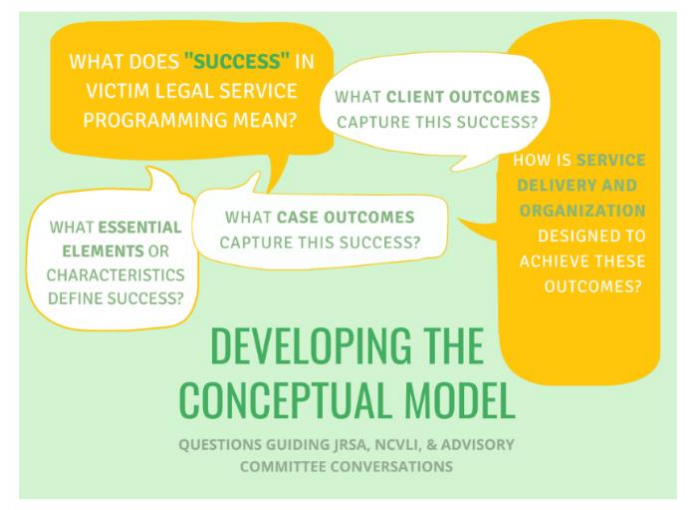
Figure ES2: Model Development

providers (N = 77); and 4) a roundtable discussion with the Advisory Committee. The resulting model is flexible for application in a variety of victim legal service program settings and approaches for evaluating programs. Here, we focus on its use in evaluation.