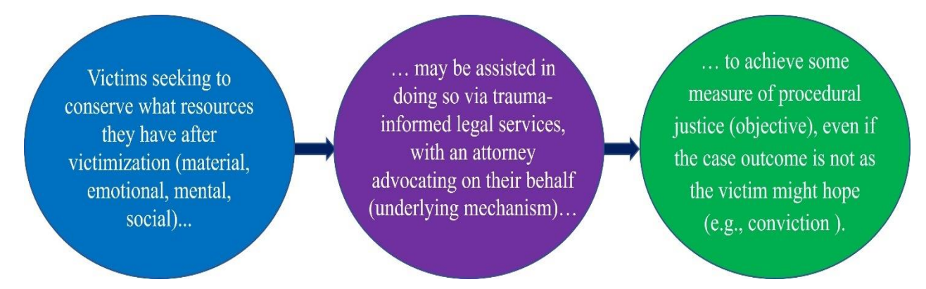
Figure ES1: Change Mechanism

Like Sullivan's conceptual model for domestic violence services (2016; 2018), this model (shown later in Figure ES3 on p. xii) provides a framework that researchers and practitioners can use to test hypotheses (in general research) and program effectiveness (in evaluation), where only more general studies about the impact of victim legal services previously existed. The model can also be a valuable resource for designing and implementing new victim legal services programs. While the "road test" of this model is still set to continue during the process evaluation, this research demonstrated how the conceptual model can be operationalized for specific programs, built out into a logic model, and implemented in practice.