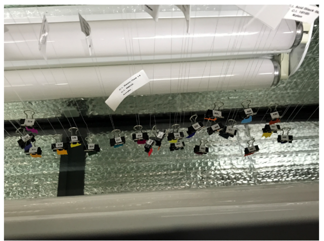
Figure 3. Microtrace fabric swatches inside the UV-radiation light box at McCrone Research Institute, Chicago, October 2017.