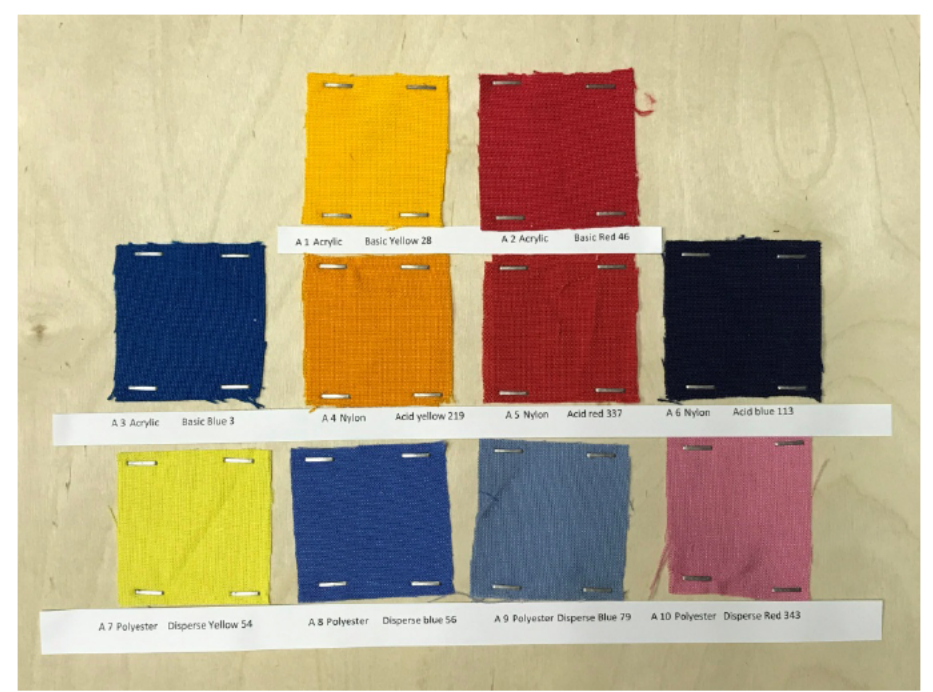
Figure 1. Sample board with Testfabrics swatches, samples A1-A10.