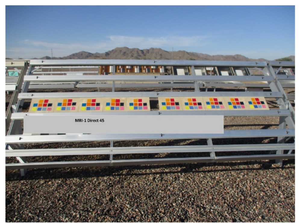
Figure 2. Sample boards with Testfabrics swatches in position at Q-Lab Test Services in Arizona, October 2017.